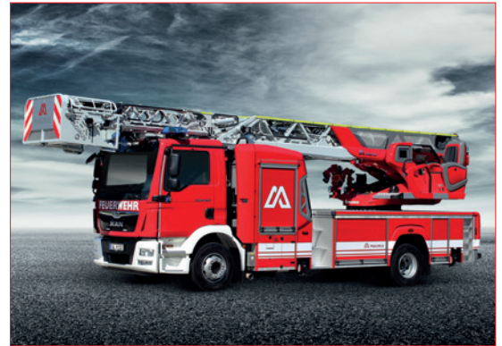
Construction possible on all common chassis