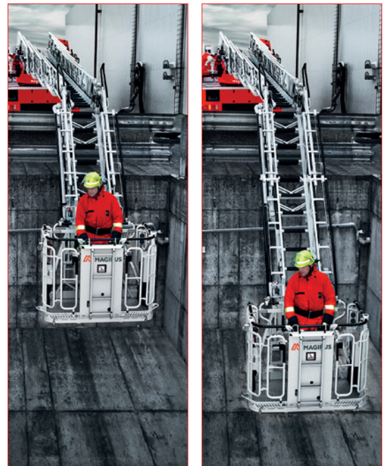
Penetration depth of an articulated turntable ladder and an articulated turntable ladder with telescopic arm in comparison

Illustrations may include additional options. We reserve the right to make technical changes or improvements at any time without prior notice. Errors and omissions excepted.