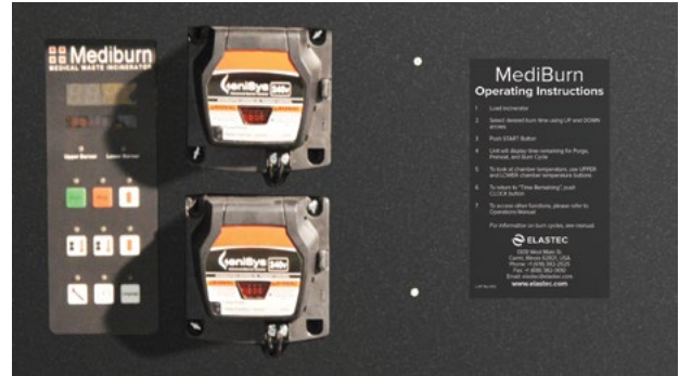
MediBurn control panel.

The electronic controls are easy to use and provide multi-language support.