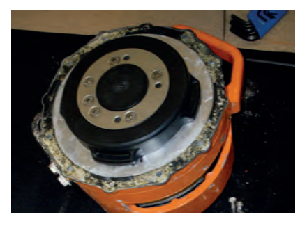
Absorber Cover Plate Removed