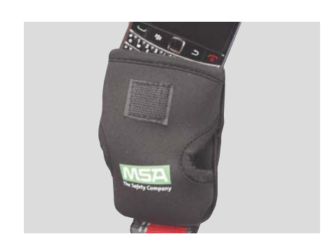
Cell phone holder now available. Part No. 10117271

Patented variable-width sub-pelvic webbing provides 50% more surface area for improved weight distribution, improving comfort during work positioning and personnel riding applications