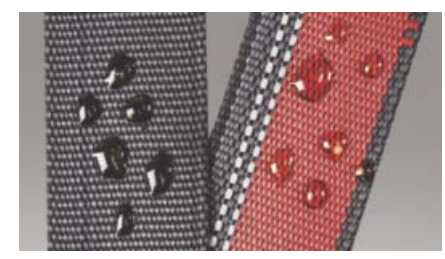
NanoSphere-coated harness repels oil and water