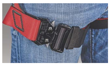
Available with aluminum Quick-Connect Leg Buckles—makes connecting and adjusting leg straps quick and easy