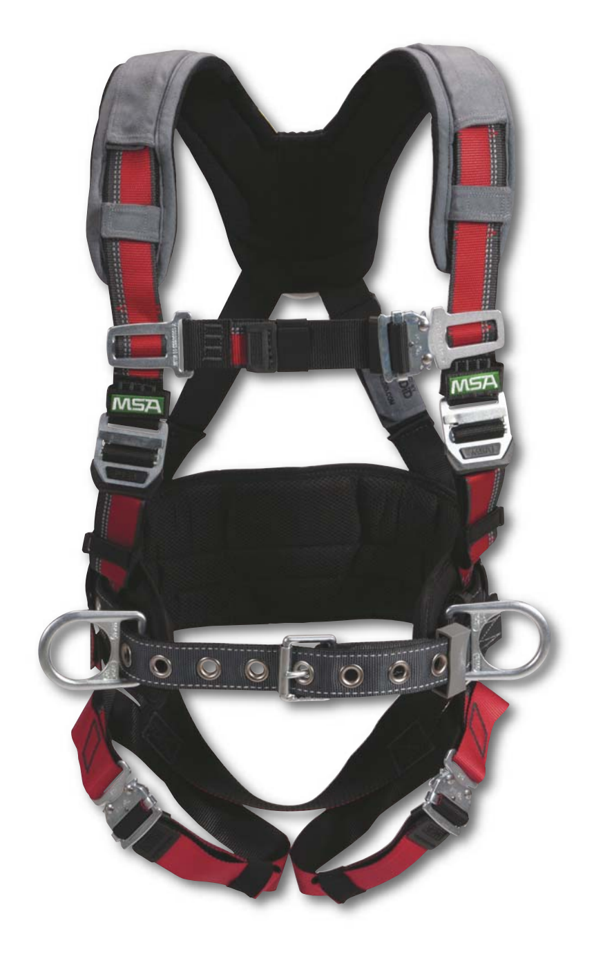
"Everything fit well." – DB, Safety Manager

All the comfort, ease-of-use, and other features of the EVOTECH harness with the added functionality of an integral back pad with tool belt.