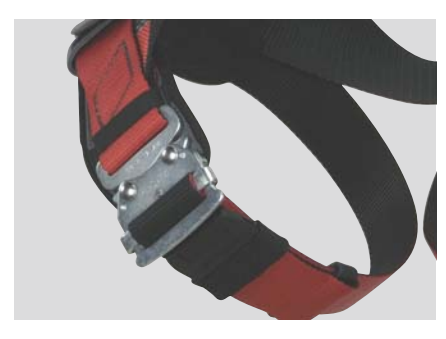
Patent-pending leg strap design keeps leg straps in place, increasing mobility and comfort

Breathable padding with moisture-wicking material keeps users cooler