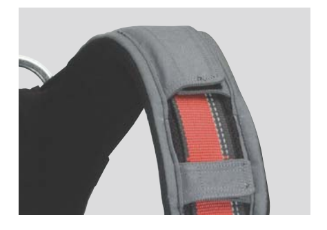
No binding edge on shoulder padding – prevents neck chafing

Breathable padding with moisture-wicking material keeps users cooler