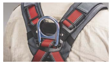
Aluminum back D-ring and hardware