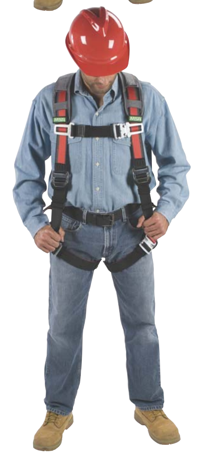
of other standard harnesses with body weight and tools." – CS, Safety Director

Patent-pending single-hand torso adjustment buckles simplify harness adjustment