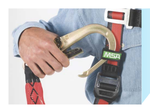
Positionable lanyard clip