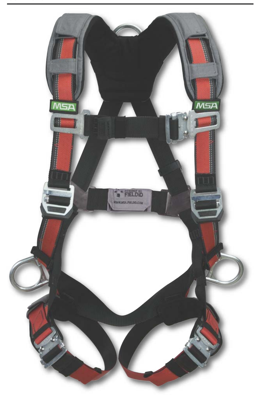
"It feels light and is easy to move around in." – TB, Carpenter