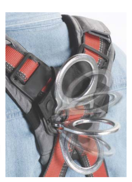
3-position back D-ring allows users to determine optimal lanyard connection position