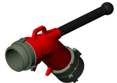
Anti-Recoil DIN 14-368 - 2.5"