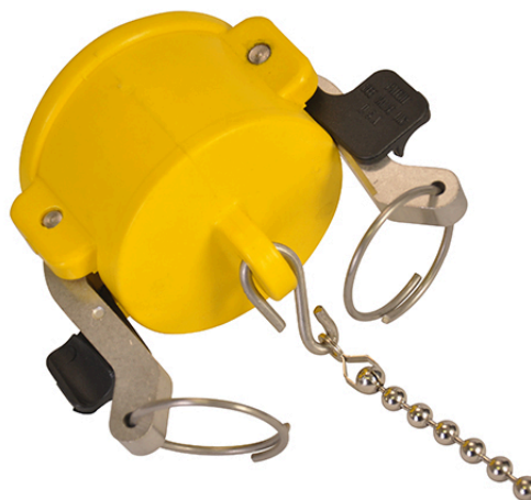
Style 4475 AkroFoam (with old control ring)