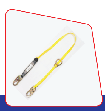
Workman® Energy-Absorbing Lanyard