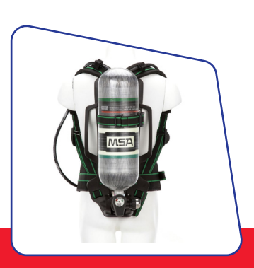
G1 Carrier and Harness Assembly