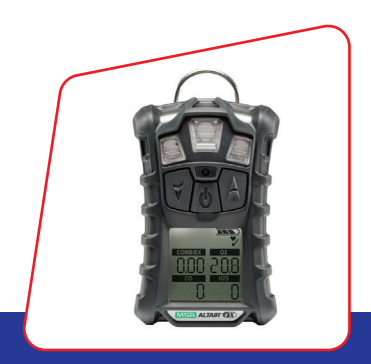
ALTAIR® 4X Mining Multigas Detector