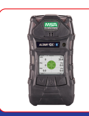
ALTAIR® 5X Multigas Detector