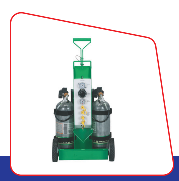
Compressed Airline Accessories