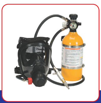
PremAire® Cadet Escape Respirator