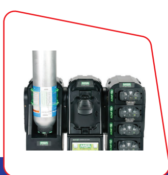
GALAXY® GX2 Automated Test System