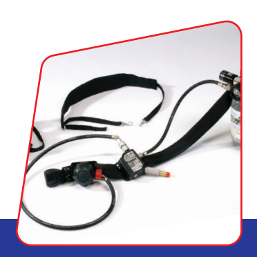
PremAire® Supplied Air Respirator System