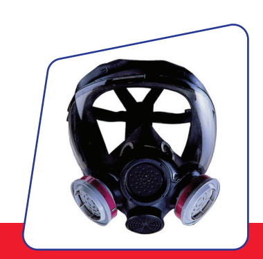
Advantage® 1000 Full-Facepiece Respirator