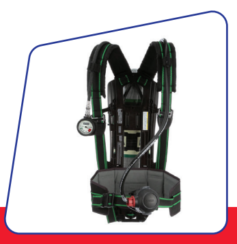
G1 Carrier and Harness Assembly