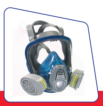
Advantage® 3200 Full-Facepiece Respirator